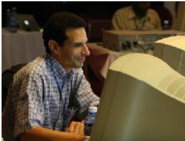
ccTLD Workshop in Nairobi, Kenya, Sept. 2005