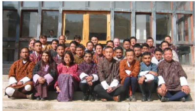
Pre-SANOG Workshop Participants, Bhutan Jan. 2005