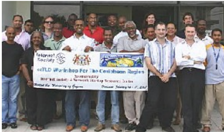
Students and instructors, ccTLD Workshop in Guyana, Feb. 2007